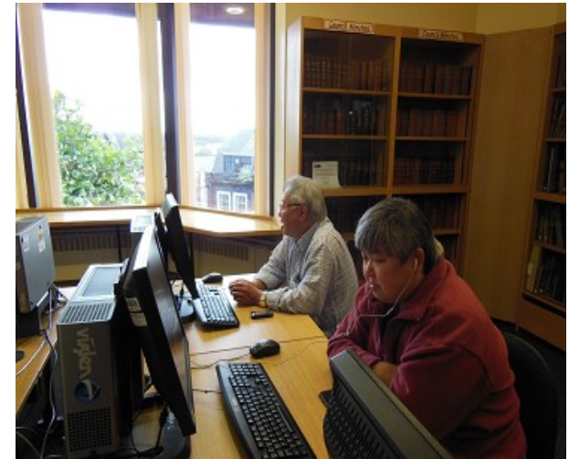
Chinese Elderly Group