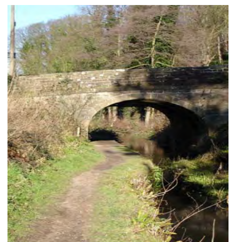
Poyser's Bridge. Listed Grade 2