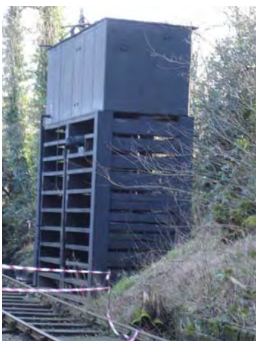
High Peak Junction water tower. Scheduled Monument