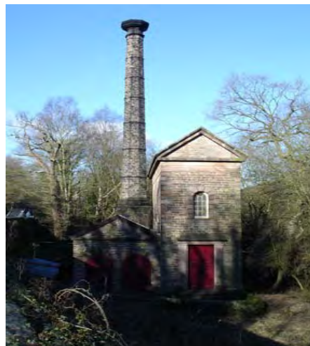
Leawood Pumphouse. Scheduled Monument & Listed Grade 2*