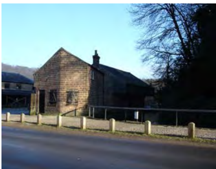
Counting House, Cromford Wharf. Listed Grade 2