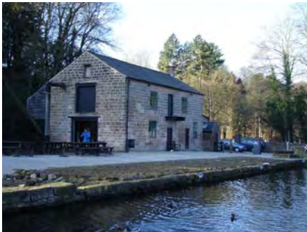
Second warehouse, Cromford Wharf. Listed Grade 2