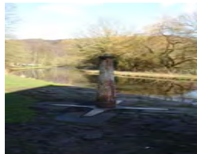
Transshipment warehouse and canopy/shed together with Sidings and Crane Stump. Scheduled Monument.