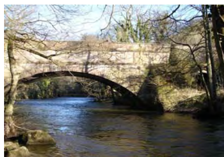
Wigwell Aqueduct. Scheduled Monument.