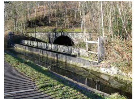
Leawood Railway/High Peak Aqueduct. Scheduled Monument