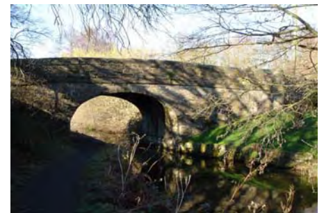
Gratton's Bridge (No. 15). Listed Grade 2