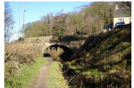
Whatstandwell canal bridge. Listed Grade 2.