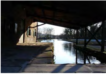
Gothic Warehouse and Loading Dock, Cromford Wharf. Listed grade 2