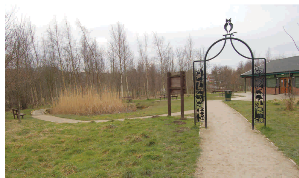
The visitor centre at Brierley Forest Park

Reproduced from the Ordnance Survey mapping with the permission of the Controller of Her Majesty's Stationery Office. © Crown copyright. Unauthorised reproduction infringes Crown copyright and may lead to prosecution or civil proceedings. 100023251 2008.