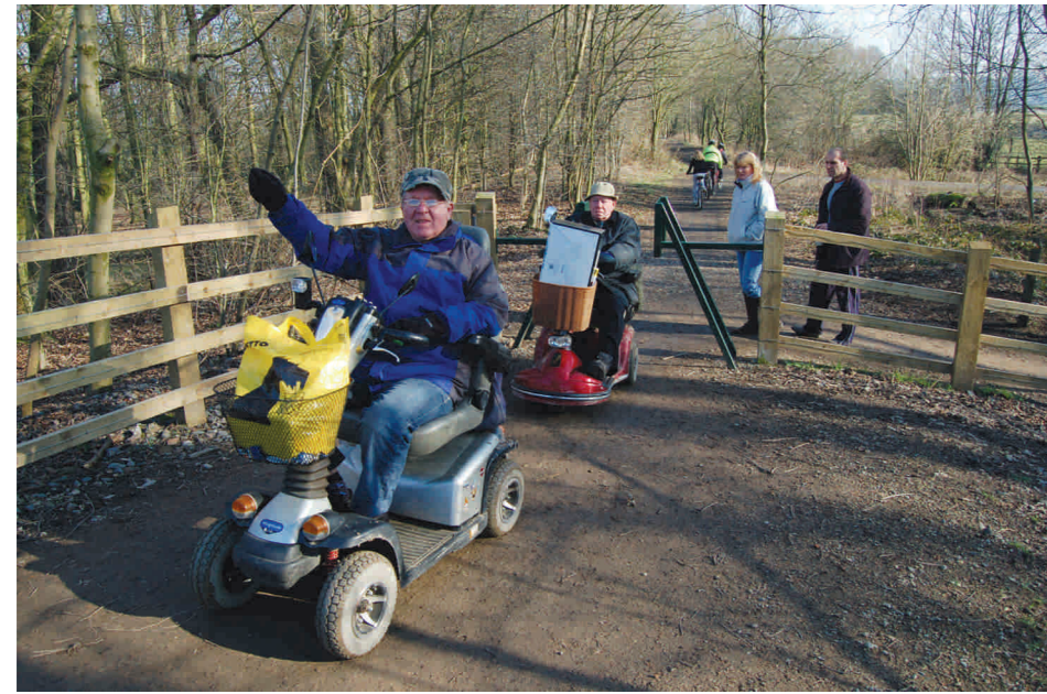
Many of the trails are access-for-all friendly.

This trail was one of the many railway tracks crossing the area, linking the collieries to the main line. The closures of the pits and railways have given us a dramatically changed landscape. We now have trails and country parks, a greenway network and links from villages into the countryside.