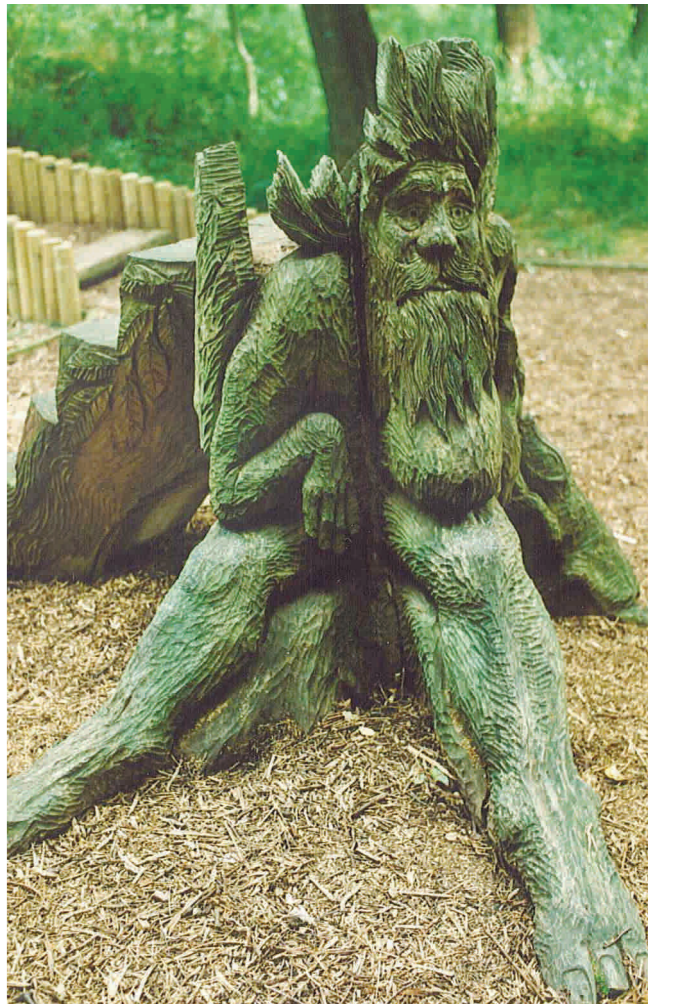
Tree sculpture at Teversal Visitor Centre

This visitor centre is run by volunteers and is usually open all year round. With lots of space for parking it is an ideal starting point to get onto the Silverhill, Pleasley and Teversal Trails and a good place for a cup of tea when you have finished!