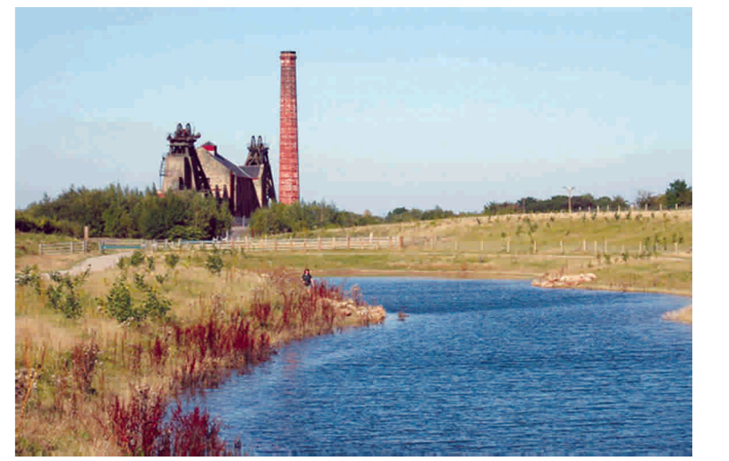
Pleasley Pit Country Park

This country park has an amazing variety of habitats. This gives nature lovers the chance to spot many different birds, dragonflies and damselflies. Through the spring and summer there is an array of wildflowers, including increasingly rare orchids. In dramatic contrast to the country park you will see the remaining pit buildings which are now a Scheduled Ancient Monument (SAM).