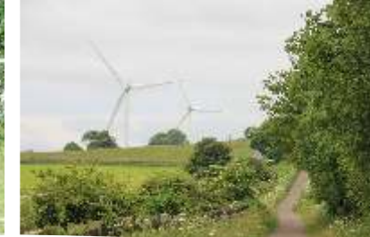
From left: Remains of the Hopton Wood boiler, Hopton Tunnel on the High Peak Trail, wind turbines from Hopton Bottom.

4 Keep the stone wall to your left, and walk up the field, watching out for capped mine shafts. At the head of the field, bear left while still keeping the wall close to you. You will soon have your first view of Carsington Water down below on your right. Still keep the wall to your left, walk along the top of the pasture. You will walk past a rock outcrop known as the King's Chair, and soon reach the woodland at the far end.