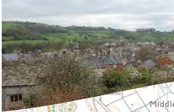
Pictured from left: View over Wirksworth from Babington House, Summer Lane leading towards Wirksworth, a view of Stoney Wood.