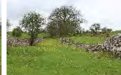
From left: A knee-trapper, or granny-stopper stile, a view of Carsington Water from Point 7 on the map, Tiremare Lane.

6 Go straight ahead across two fields, through the bumps and hollows left by old lead mines. Keep the stone wall to your left until you come to a wicket gate into the third field. The path now goes slightly downhill to another wicket gate in the wall opposite.