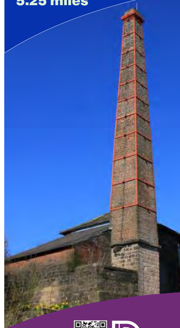
Chimney at Middleton Top Engine House