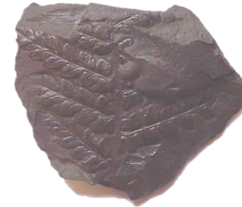
Seed fern leaves