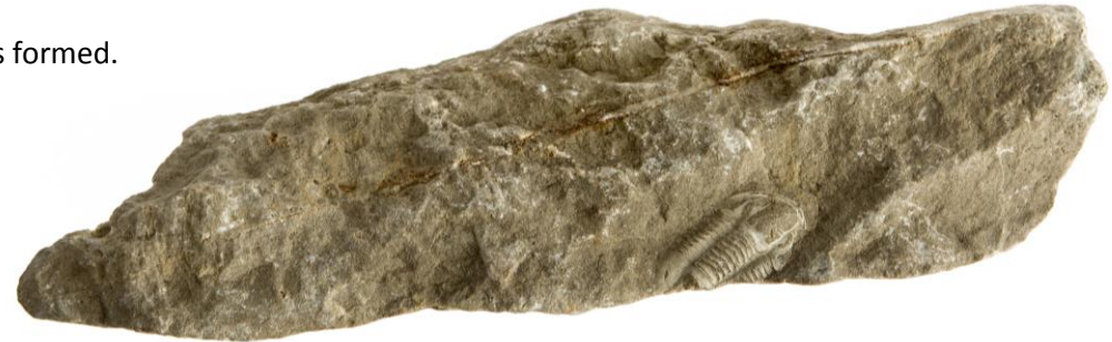
Trilobite fossil in limestone

Handling collection, Play doh! dental alginate or clay (at school), PowerPoint Prehistoric Wonders