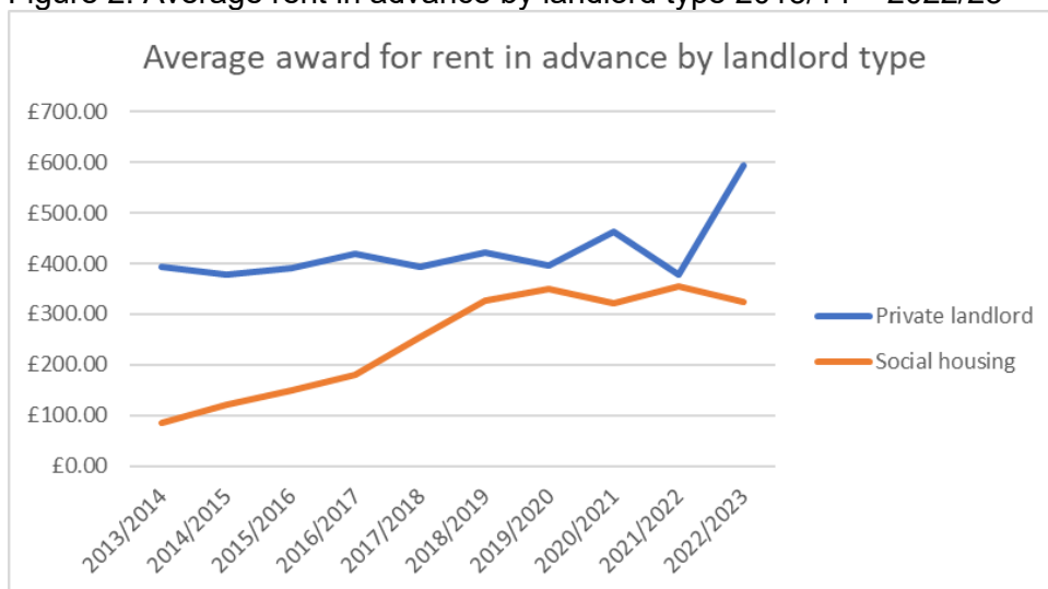
Figure 2: Average rent in advance by landlord type 2013/14 – 2022/23

There has also been a shift in social landlords requiring four weeks' rent in advance rather than one week, leading to an increase in the average amount spent on rent in advance for social tenancies (average has increased from under £100 for social landlords to approximately £350). This reflects policy changes by social landlords in response to the roll out of Universal Credit.